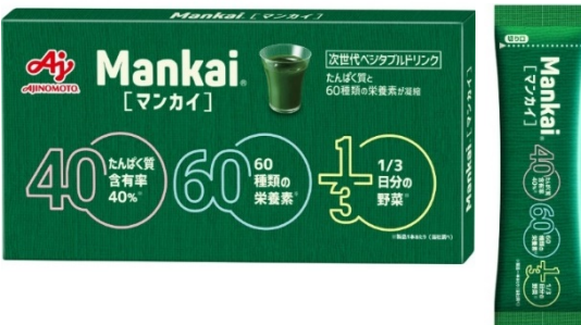
Mankai<sub>®</sub> 30-stick (an approximately 30-day supply)

TOKYO, July 27, 2021 -- Ajinomoto Co., Inc. ("Ajinomoto Co.") will launch sales of Mankai ® a next-generation vegetable drink consisting primarily of Mankai plant ( Wolffia )—the world's smallest vegetable<sup>2</sup> and a promising next-generation food resource—on July 30, 2021 (Fri.). In addition to delivering a diverse mix of vitamins, minerals, and dietary fiber, Mankai ® contains a total of 60 nutrients, including quality vegetable proteins crucial to muscles and blood. It all combines into a brand-new, next-generation vegetable drink that lets consumers get plenty of protein and at least one-third of their recommended daily vegetable intake<sup>3</sup> in a single package.