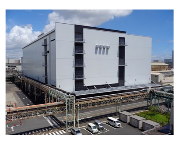
Exterior view of the new plant

Ajinomoto Co. has set out a vision of becoming a solution-providing group of companies for food and health issues. To achieve this vision, we are reorganizing the production system at our Japan Food Products business. As part of this effort, Ajinomoto Food Manufacturing Co., Ltd., a new company responsible for the production of seasonings and processed foods in Japan, was launched in April 2019. Structural reforms to gradually consolidate our plants in Japan are underway.